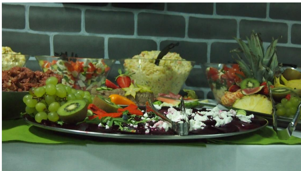
The beautiful and tasty buffet, served at the farewell party

After that the farewell party took place in a club in the city. Again there was fantastic food. After all of us had eaten we were dancing and having fun, enjoying the last evening together.