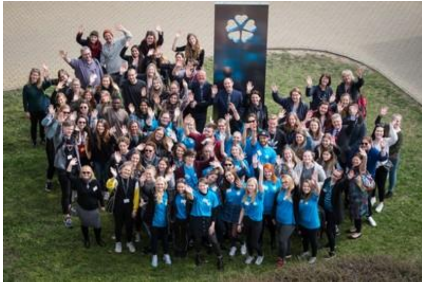
All participants of the International week in Budweis

nationalities in it. That was a great chance to get to know new people. After that official part of the program, we had the opportunity to go to a bar. More than half of all participants took this chance and so we had a good first evening.