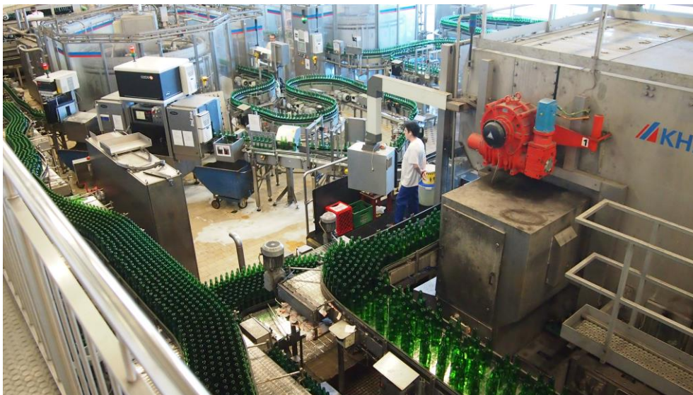
Plenty of beer bottles are filled in the brewery every minute

The last full day was Thursday, it started with a field trip. After lunch we had the possibility to have a tour through the Budweiser Brewery, there we learned a lot about beer.